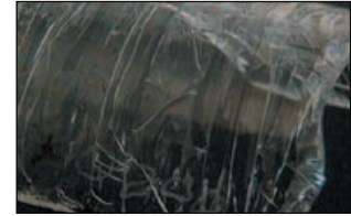
Crack formation in a natural quartz glass tube irradiated for about 300 hours with 172 nm UV radiation.

Heraeus provides premium quartz glass tubes for UV and deep UV. These tubes have a superior transmission and a significantly improved life-time compared to standard natural quartz glass. Natural quartz glass that is irradiated with UV or deep UV light will show cracks after long irradiation times. Cracking may lead to damage of lamps or sleeves. In addition the UV transmission is reduced over time. Heraeus Suprasil 310 and Heralux plus or even Heralux